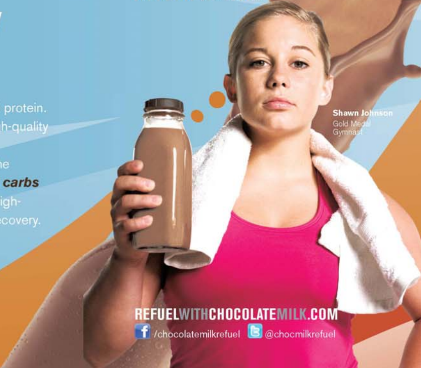
Shawn Johnson Gold Medal Gymnast

You've worked out too hard to turn back now. Get the benefits you deserve with Nature's Recovery Drink, lowfat chocolate milk.