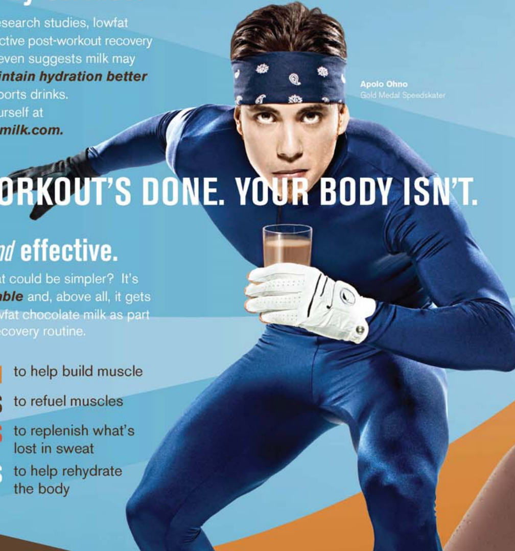
Apolo Ohno Gold Medal Speedskater